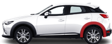
Back wheel arches