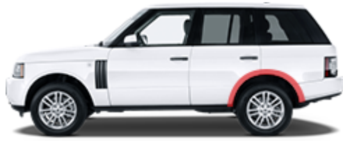
Back wheel arches